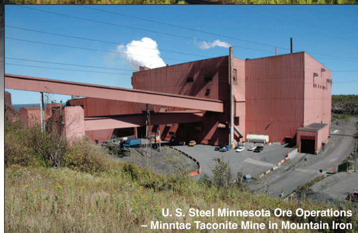
U. S. Steel Minnesota Ore Operations – Minntac Taconite Mine in Mountain Iron