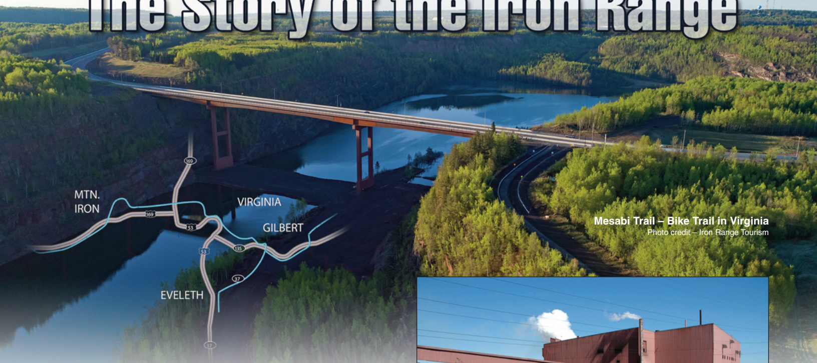
Mesabi Trail – Bike Trail in Virginia