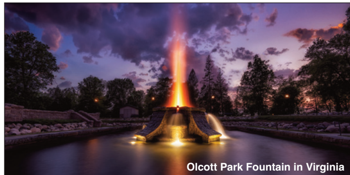
Olcott Park Fountain in Virginia