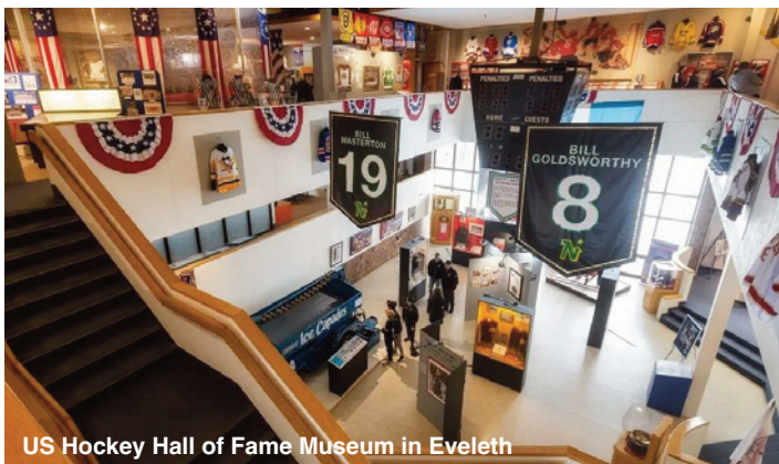
US Hockey Hall of Fame Museum in Eveleth

We call ourselves "Rangers" and are proud of our mining history, ties to the Old World, and rugged natural beauty. Nature and the great outdoors are precious to us – from time spent on the water to time spent on the trails – the Iron Range offers it all. Come back to visit in the warmer months...sorry, no curling ice in August!