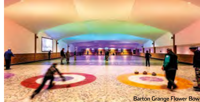
Barton Grange Flower Bowl

and had introduced more than 5,000 people to curling.