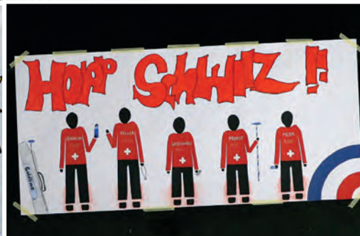
All pictures © Richard Gray except where noted.